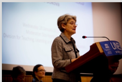
Irina Bokova, Director-General of UNESCO, at the opening of the Second UNESCO Forum on GCED