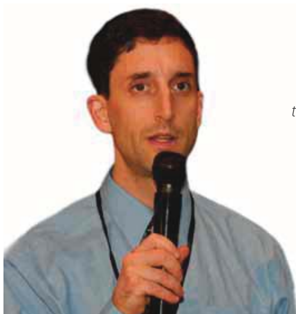
Ilan Kelman Island Vulnerability

'There is no need to separate disaster risk reduction and climate change work.'