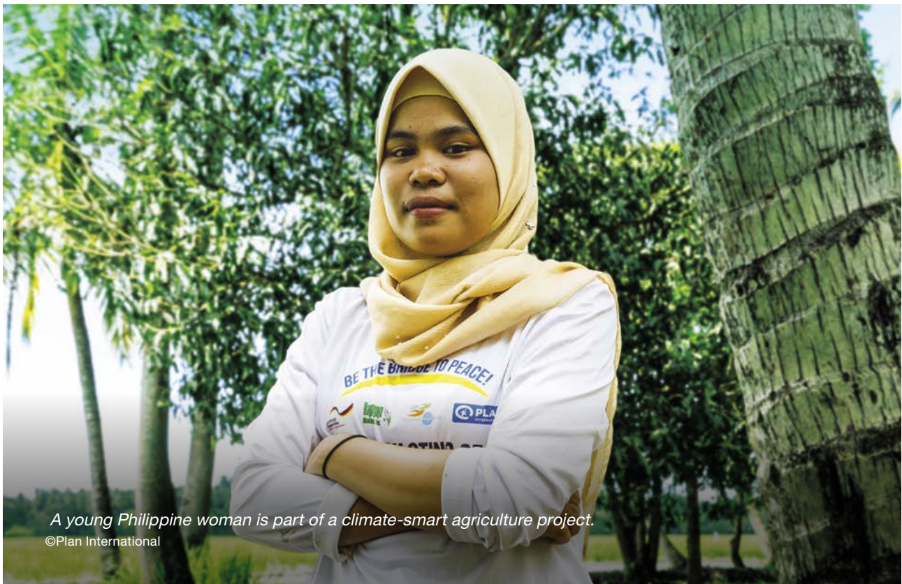
A young Philippine woman is part of a climate-smart agriculture project.