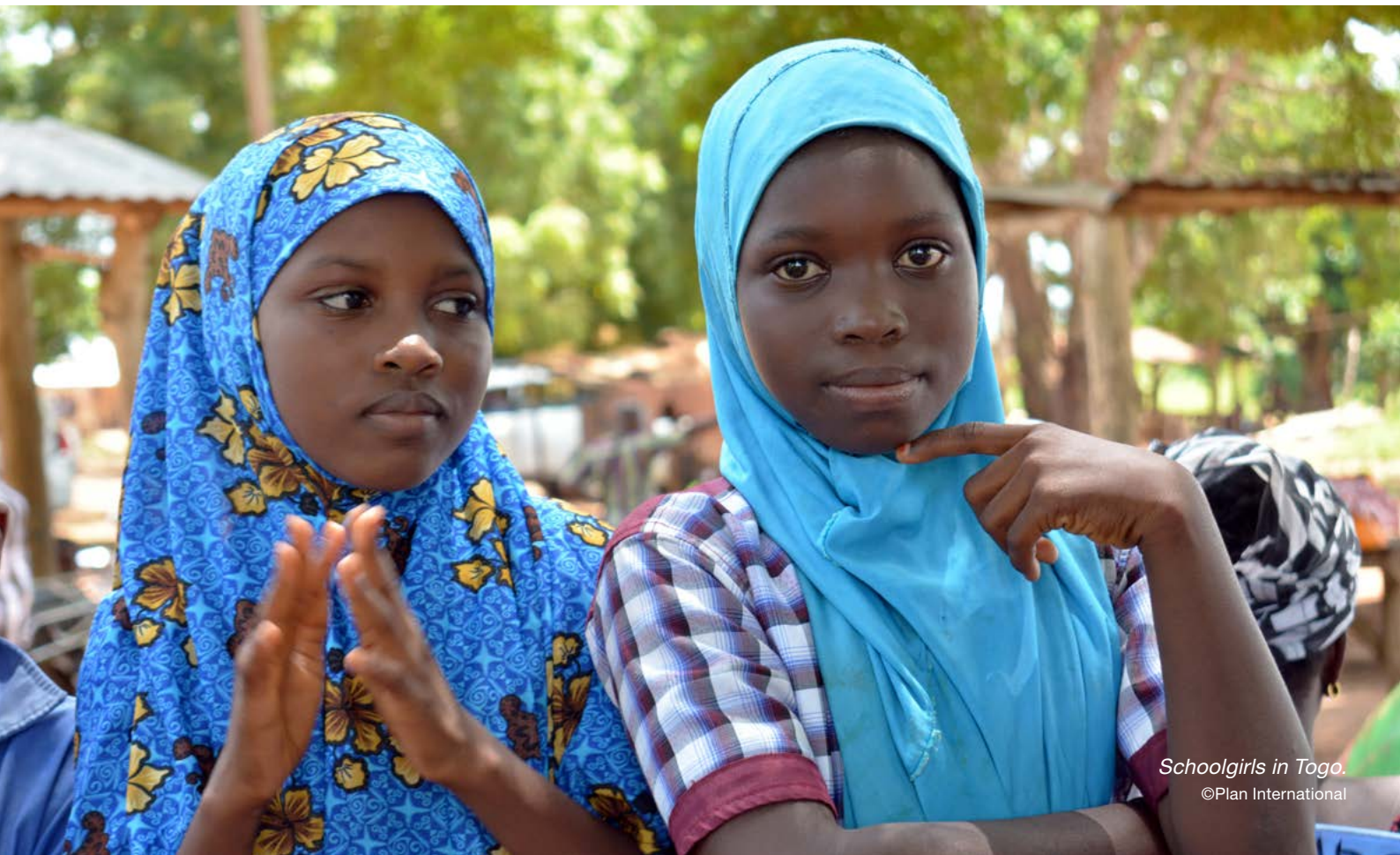
Schoolgirls in Togo.