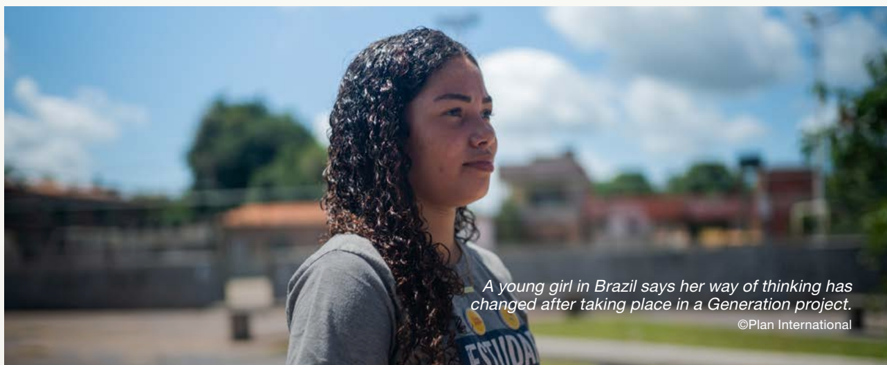
A young girl in Brazil says her way of thinking has changed after taking place in a Generation project.