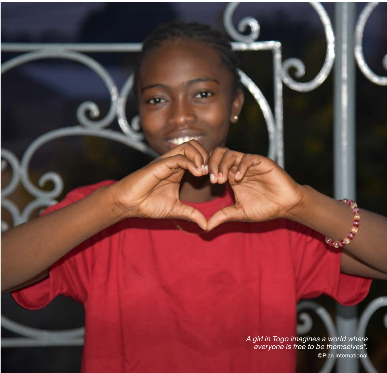
A girl in Togo imagines a world where everyone is free to be themselves".