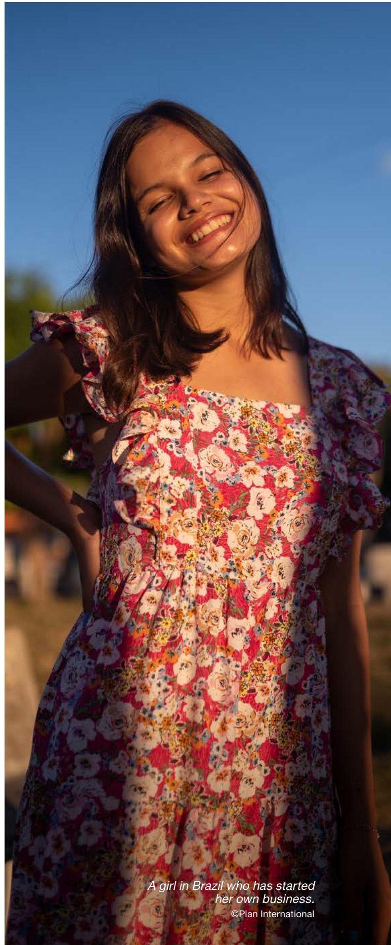
A girl in Brazil who has started her own business.

This reflects the broader picture of climate change education in Cambodia where education is not seen by the government as integral to climate change mitigation, and much of the climate change curriculum is delivered by institutions such as INGOs and the UN rather than mainstreamed through the national education system.