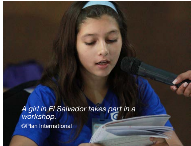
A girl in El Salvador takes part in a workshop.