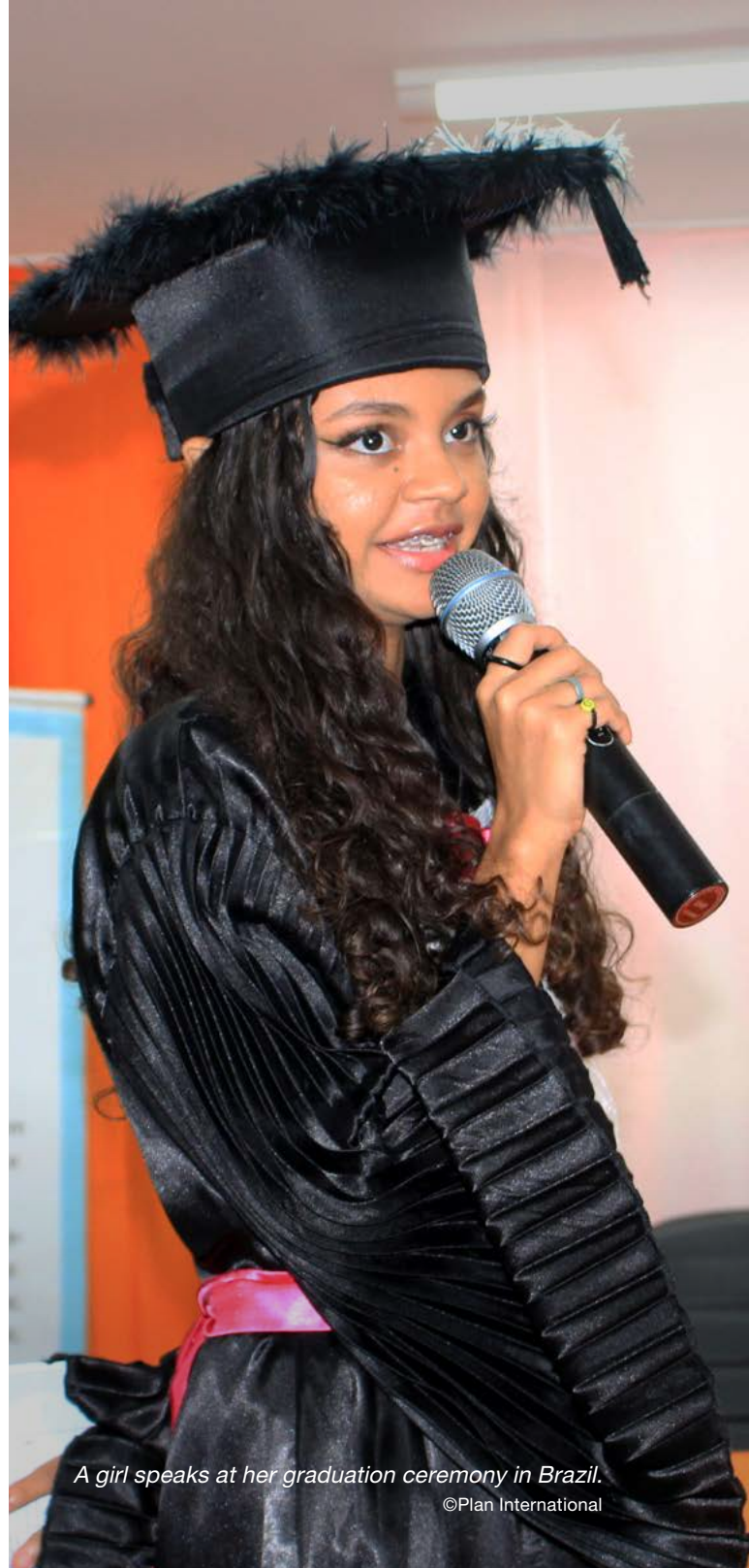
A girl speaks at her graduation ceremony in Brazil.