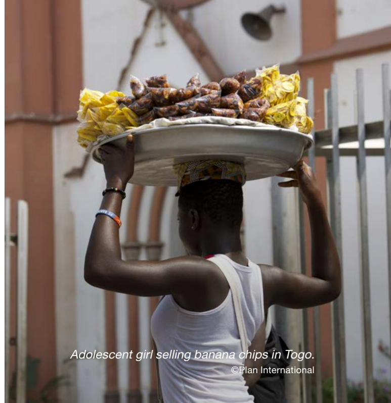
Adolescent girl selling banana chips in Togo.

Overall, the gendered impacts of climate change are wide-ranging: they include an increase in unwanted pregnancy, as adolescent girls and women struggle to afford contraceptives, escalating sexual exploitation as some feel forced to sell or exchange sex to support themselves, and an increase in CEFMU. The latter often a coping strategy for families struggling to feed their children.