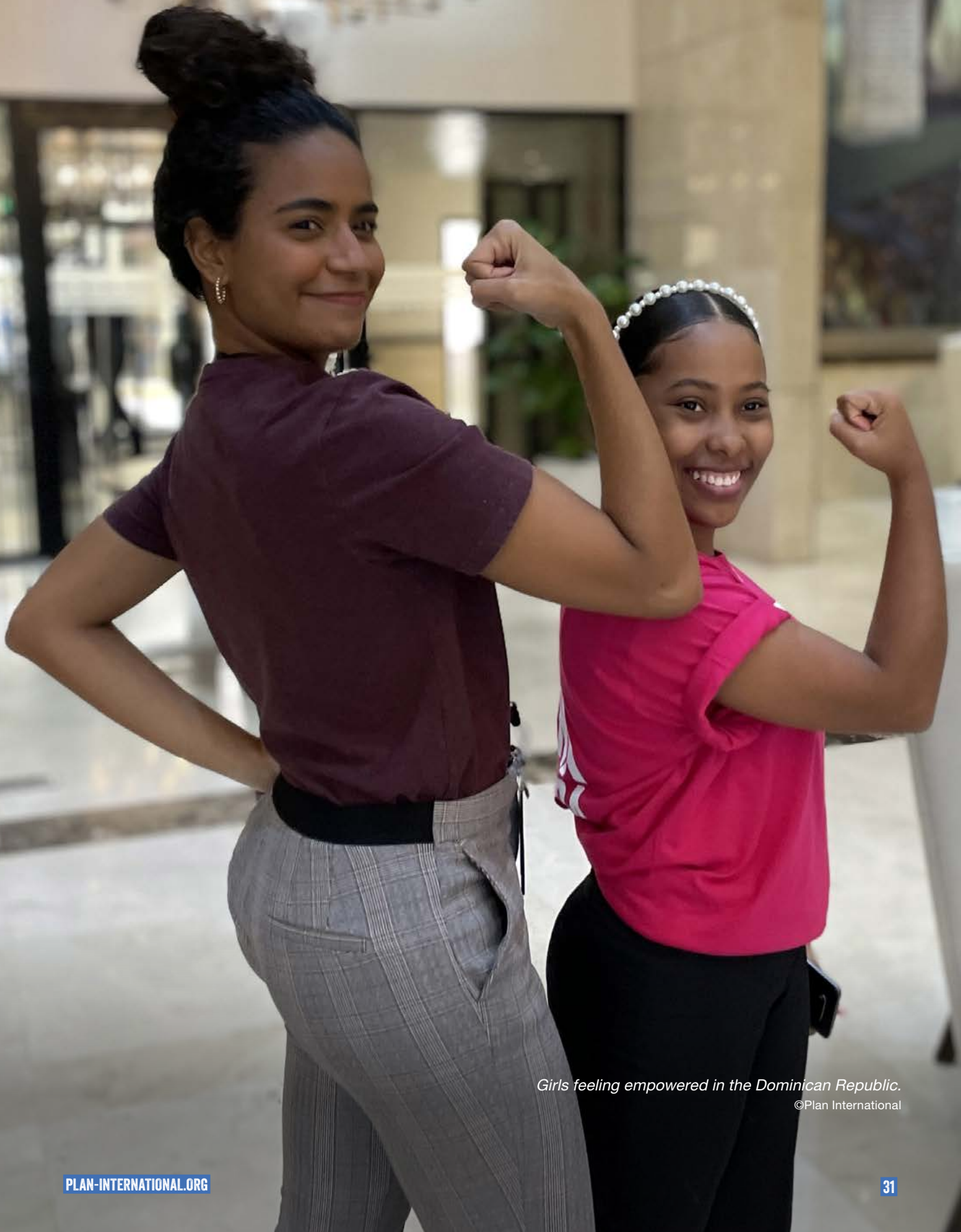
Girls feeling empowered in the Dominican Republic.