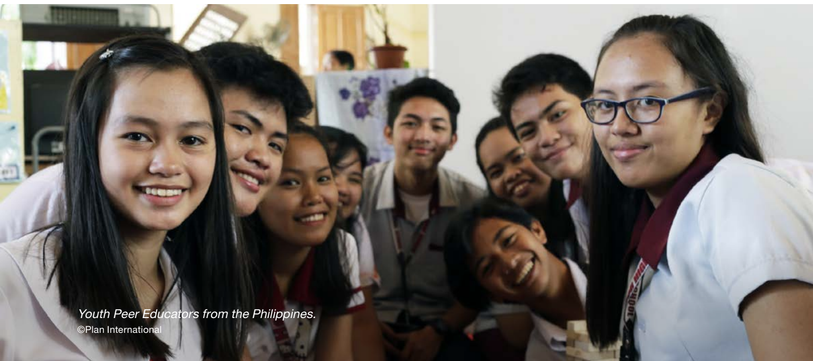
Youth Peer Educators from the Philippines.