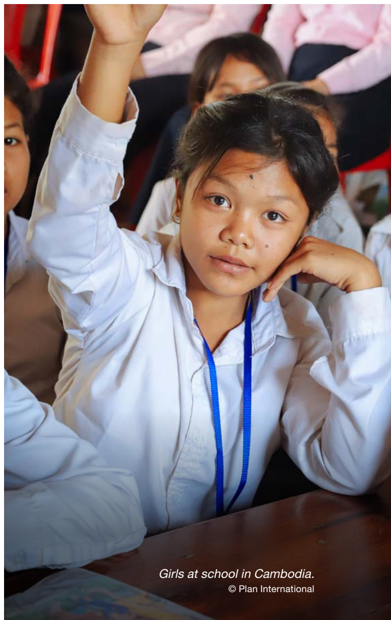
Girls at school in Cambodia.

To this end we work with children and their communities to reduce climate risks, adapt to climate change and strengthen resilience. We support their meaningful participation in decision making and in leading climate action in their communities. Innovative, games-based and experiential learning approaches are used, which we integrate into community and school systems to maximise long-term impact.