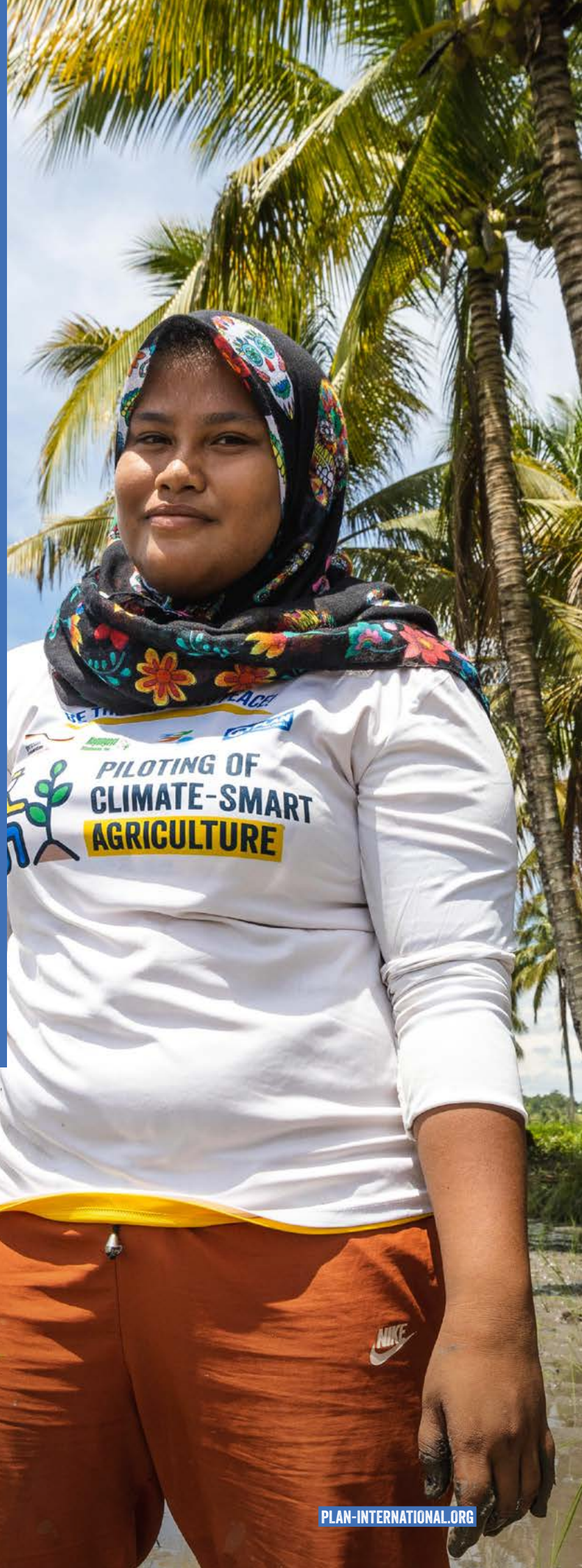
A girl picking rice in the Philippines.