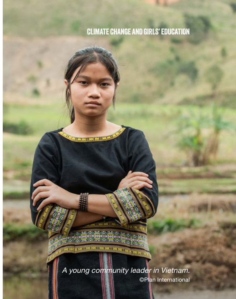
A young community leader in Vietnam.

The experiences, observations and conclusions noted throughout the many and varied studies on the impact of climate change on girls' lives are