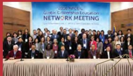
These initiatives are guided by the principles set during the first global gathering of GCED partners in 2016 in Seoul, Republic of Korea

The inclusion of Global Citizenship Education (GCED) in the SDGs reflects the clear call around the world for an education that enables learners to play active roles in seeking solutions to global challenges we are facing. Inspired by the wealth of initiatives happening on the ground, APCEIU, together with key partners, launched the GCED Actors' Platform and the Regional GCED Networks, to find ways to strengthen GCED implementation through partnership. These initiatives allow like-minded organizations to collectively contribute towards one common vision: to realize GCED by 2030. We invite you to this important endeavor.