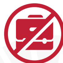
TABLE 1 OUT-OF-SCHOOL CHILDREN AND ADOLESCENTS

In the following tables all missing data is highlighted in red or orange. The source of data is the UNESCO/UIS eAtlas for Education 2030, the official database to monitor country level progress towards the achievement of the SDG4 20 or the UNESCO/UIS eAtlas for Out-of-school children 21 . Data are for the most recent year available in the specified period.