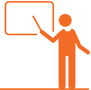
TABLE 2 TRAINED TEACHERS