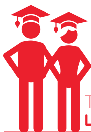
TABLE 3 LEARNING OUTCOMES